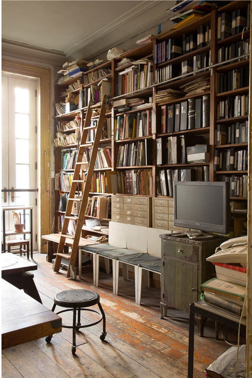
A view of the parlor in Louise Bourgeois's home on 20th Street in New York City, 2016.