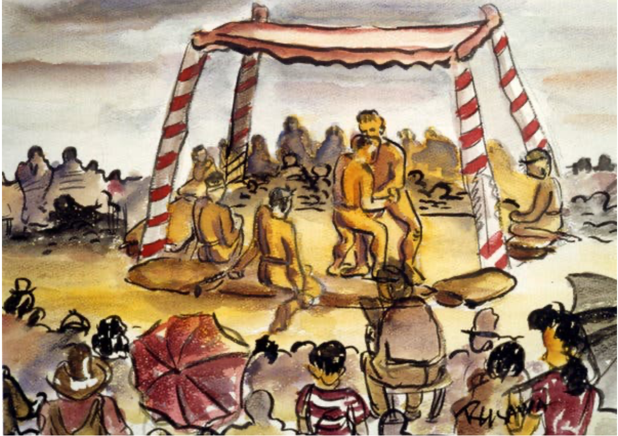
Ruth Asawa's "Sumo Wrestlers" (1943).