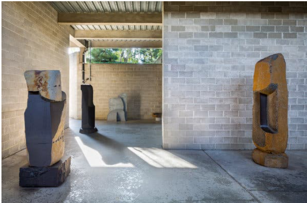
The Noguchi Museum in Queens, N.Y., featuring (from left) Isamu Noguchi’s “Break Through Capestrano” (1982), “Shiva Pentagonal” (1981), “Cloud Mountain” (1982-83), “Garden Seat” (1983) and “Deepening Knowledge” (1969).

The word “archive,” from the Latin archivum or archium , traces back to the Greek word arkheion , which referred both to the physical space where archival documents were stored as well as to the archons, or citizens, deputized to manage it. It is both the primary source, the literal remnants of what existed from a time and place, as well as the physical location where such documents are kept. Archives are unique to a person, to a government, to a period of history — no two are ever alike — and they are often available to browse but not necessarily open to the public like a library might be, nor are they reproduced or, in most cases, moved. Their purpose is almost more useful to grasp as an idea than as a practicality: Here lies everything we can’t remember but should never forget. Archives possess an inherent power — they are the authority on what or who will remain within the historical narrative.